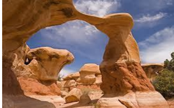
Escalante – Grand Staircase